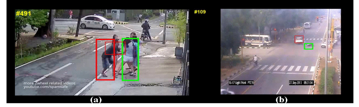
Fig. 2. The sample snapshot of the preliminary results of the work under development (a) For Mugging Scenario: The system identifies event, where the perpetrator is marked by the system in thick red bounding box whereas the victim in thick green bounding box and the snatching action in thin red bounding box. (b) Hit & Run Scenario: The system identifies event, where the perpetrator is marked by the system in thick red bounding box whereas the victim in thick green bounding box.

A part of this algorithm is in combination with description-based methodologies and varies from measurable and syntactic methodologies through a capacity unequivocally to express human activities' spatiotemporal structures. In this manner, such routines can perceive both sequential and simultaneous actions rather being constrained to sequential actions. Essentially, description-based