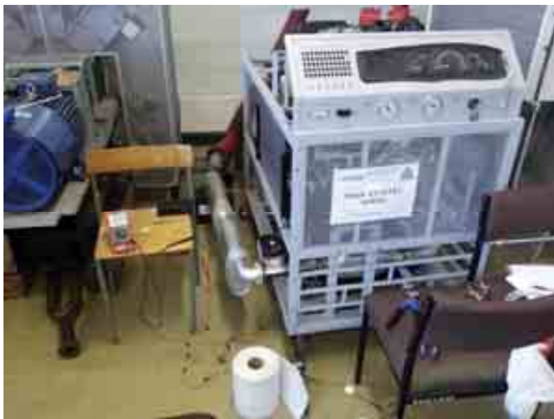
Fig. 3. Photo of a testbed with the ECOTEC X18XE engine

A Peltier cell was attached to the exhaust pipe's surface while using silicon. Before the Peltier cell was installed, the heat-collecting radiator, mentioned earlier, was first installed on the cell's cold side. A multi-purpose meter was connected to the TEG terminals.