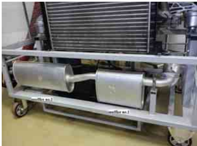
Fig. 5. Photo of a test bed with the mufflers marked

Moreover the prevailing temperatures in the exhaust system were examined.