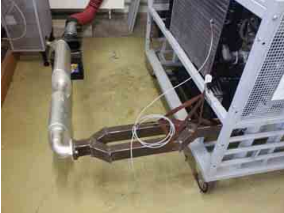
Fig. 4. Photo of the test bed with a rectangular pipe. ECOTEC XI8XE engine

The meter was reading the values of the voltage generated by TEG. Time was measured with the use of a chronometer, with voltage changes being measured at the same time. The measurements were performed for two states: for the engine operating at neutral gear (idle), at 800 rpm, and for constant speed of 2000 rpm.