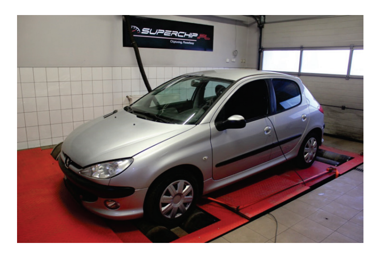
Fig. 2. View of the tested vehicle on the chassis test bed

Studies of the operating parameters of a drive unit powered with the mixture of the diesel oil and the fatty acid methyl esters were conducted on the loaded chassis test house with the Eddy-current brake, presented in Fig. 2.