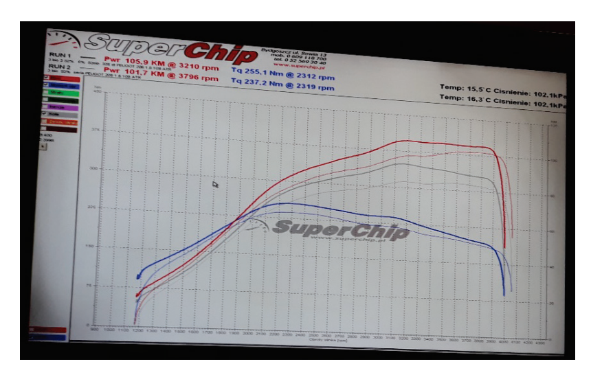
Fig. 3. Exemplary data from the chassis test bed displayed in real time

The course of the tests performance depends on the scope of conducted tests and the determined testing purpose. In case of measurement of the effective output and the torque moment of a drive unit powered with the mixture of different content of diesel oil and the fatty acid methyl esters, the tests were conducted at full load. At the time of the measurement, the vehicle mounted on the test bed was brought up to the speed of 140 km/h. The obtained measurement results were automatically generated by the software in the tabular and graphical form. The direct results displayed in real time could be observed on the computer's screen, and these were the following ones: rotational speed of the engine, driving speed, adjusted engine's power, and adjusted torque moment, loading of an Eddy-current brake, temperature of the air choked by the engine and pressure of water steam in the air. In Fig. 3 there are presented the exemplary results, which are obtained at the time of the tests on the loading chassis test bed.