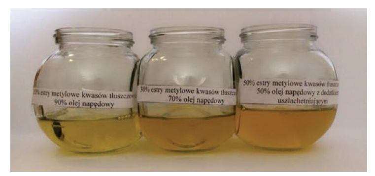
Fig. 1. Mixtures of diesel oil and the fatty acid methyl esters