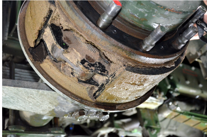
Fig. 12. Actuators of the braking system of the main test object after driving out of the soggy terrain of the training ground