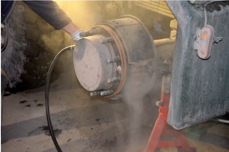
Fig. 8. Actuators of the braking system of the main test object after completing the training ground mileage