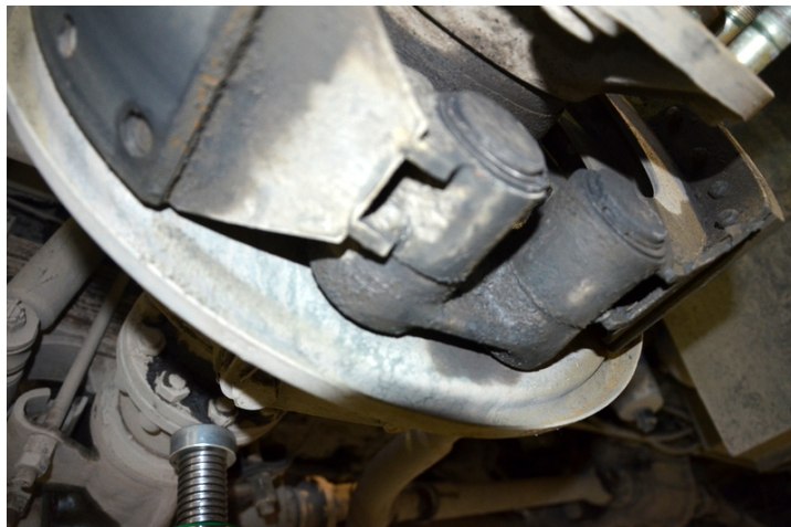
Fig. 6. STAR 266 braking system actuators after completing the training ground mileage. The elements of the braking system for the main test object have been presented in the Figures 7-12 below