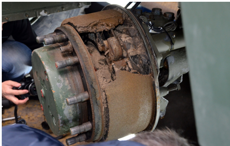
Fig. 9. Actuators of the braking system of the main test object after driving out of the soggy terrain of the training ground