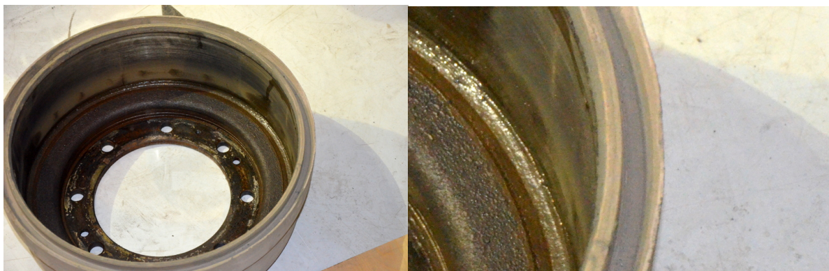
Fig. 1st Star 266 drum brake with the lock as a very important structural element of the drum brake that affects the limitation of penetration of sand, gravel and mud into the drum

A comparison of the drum brake structure used in Star 266 vehicle and the one used in the test object are presented in the following figures.