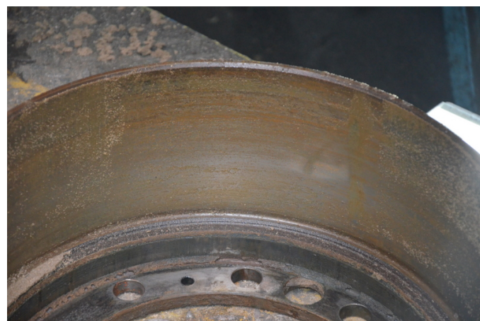
Fig. 13. The inside of the drum brake of the main test object after driving out of the soggy terrain of the training ground