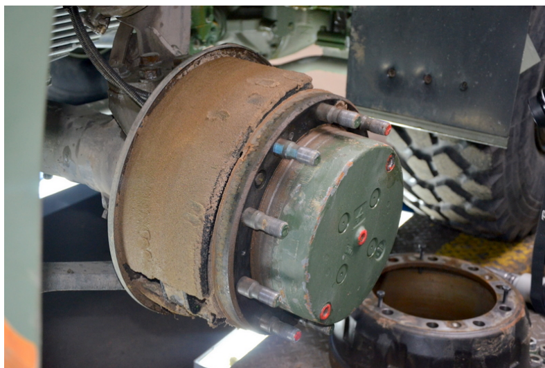
Fig. 10. Actuators of the braking system of the main test object after driving out of the soggy terrain of the training ground