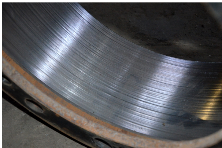
Fig. 7. The inside of the drum brake of the main test object after completing the training ground mileage (scratches and dents)