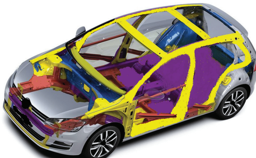
Fig. 5. Graphical representation of composite lining in the monocoque chassis of a commercial car