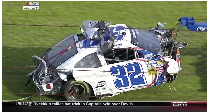
Fig. 1. NASCAR 2013 car crash

synthesize the material in composite form. For this a methodology has been created which will help us to find the desired composite material and apply it to improve the crashworthiness of the car.