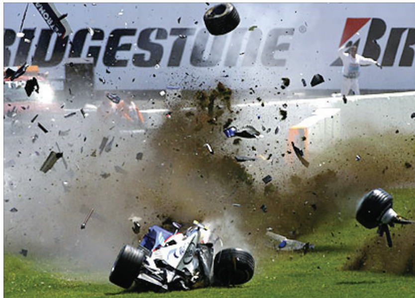
Fig. 2. Formula 1 car during a fatal crash