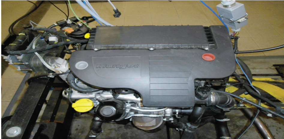
Fig. 1. FIAT Multijet 1.3 JTD 16 V engine with air filter being fitted