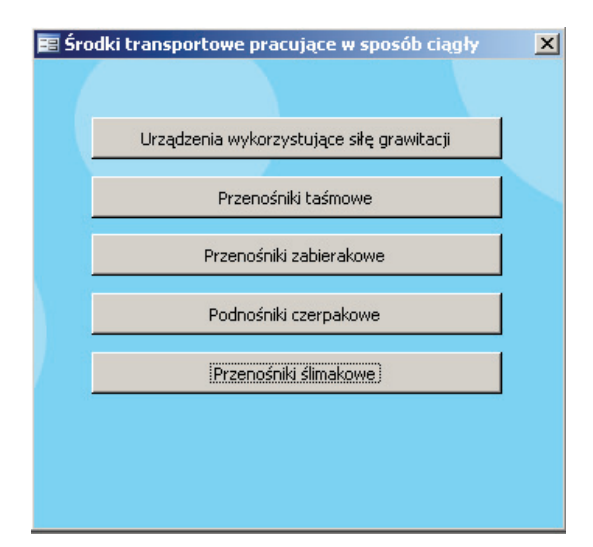
Fig. 1. Starting window

The application in question was created in a form of "tree" consisted of connected forms, databases, reports, and queries. In order to make the software using easier and clearer, a starting window containing five buttons, was designed; press of any results in displaying forms assigned to particular types of continuous handling means (Fig. 1).