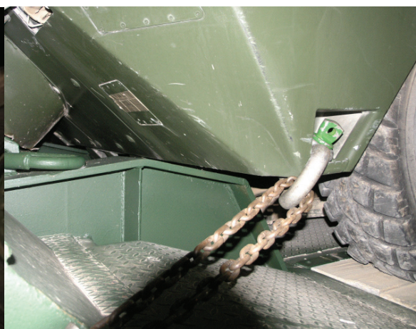
Fig. 3b) Example of mounting the damaged AFV transported on trailer by aircraft AN 124-100