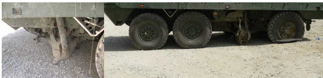
Fig. 1. Example of a typical damage in AFV Rosomak

In order to understand the problem how complex the damages resulting from the IED explosion impact on the AFV Rosomak are, I shall present it in (Fig. 1) using various sizes of IED.