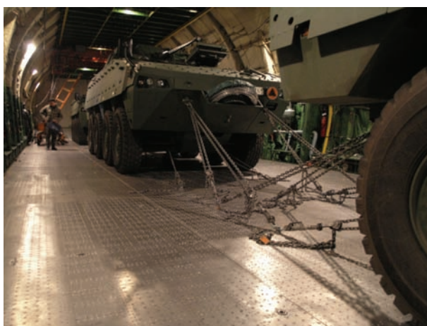
Fig. 3a) View of front mounting points for AFV Rosomak on board of aircraft AN 124-100