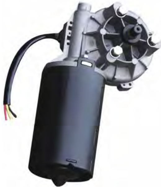
Fig. 1. Engine with worm gear used in drives of car wipers

The typical engine power of car wipers is 150W. In the Fig. 1 is shown the typical transmission of drives of car wipers. This is a worm gear. As shown, the body of transmission is ribbed to caring away of heat. The worm gears characterizes by low efficiency, so it is necessary to cooling.