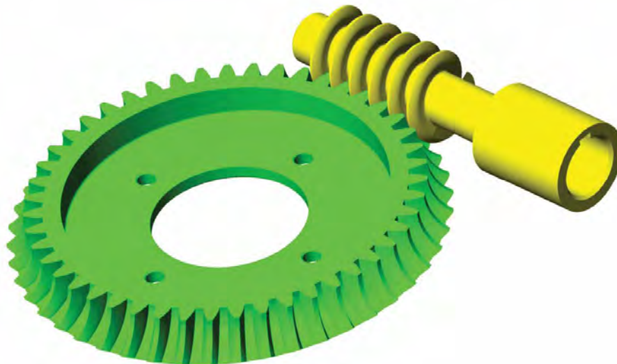
Fig. 4. Intermediate transmission between worm gear and spiroid gear – CAD model