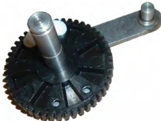
Fig. 2. Simplified worm wheel

Owing to technological requirements, a worm of the typical transmission is mostly cut on the shaft of engine, whereas the worm wheel is made with polymer and its geometry is simplified to cylindrical gears with helical or even straight teeth (Fig. 2).